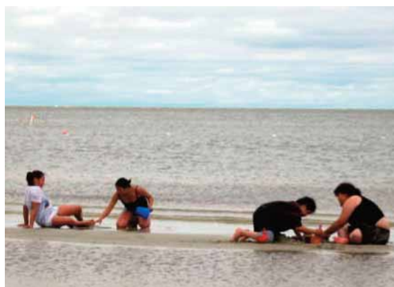
An afternoon at the beach at Camp Maryglen

Everyone was relieved (if not somewhat embarrassed) when they were informed that it